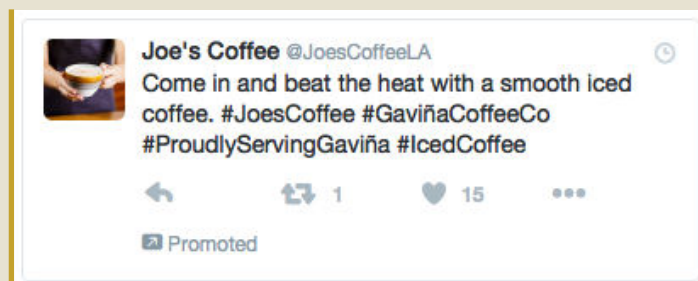
Example Twitter Post